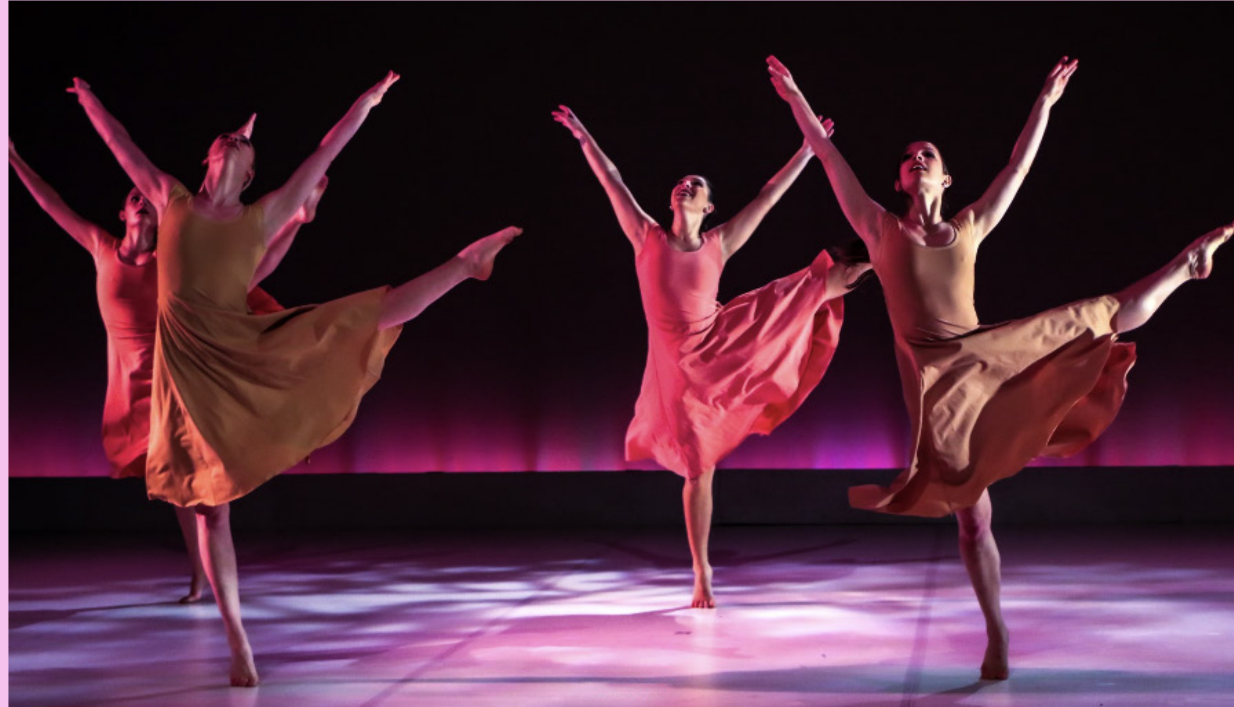
WORLD-CLASS ARTISTS + PERFORMANCES