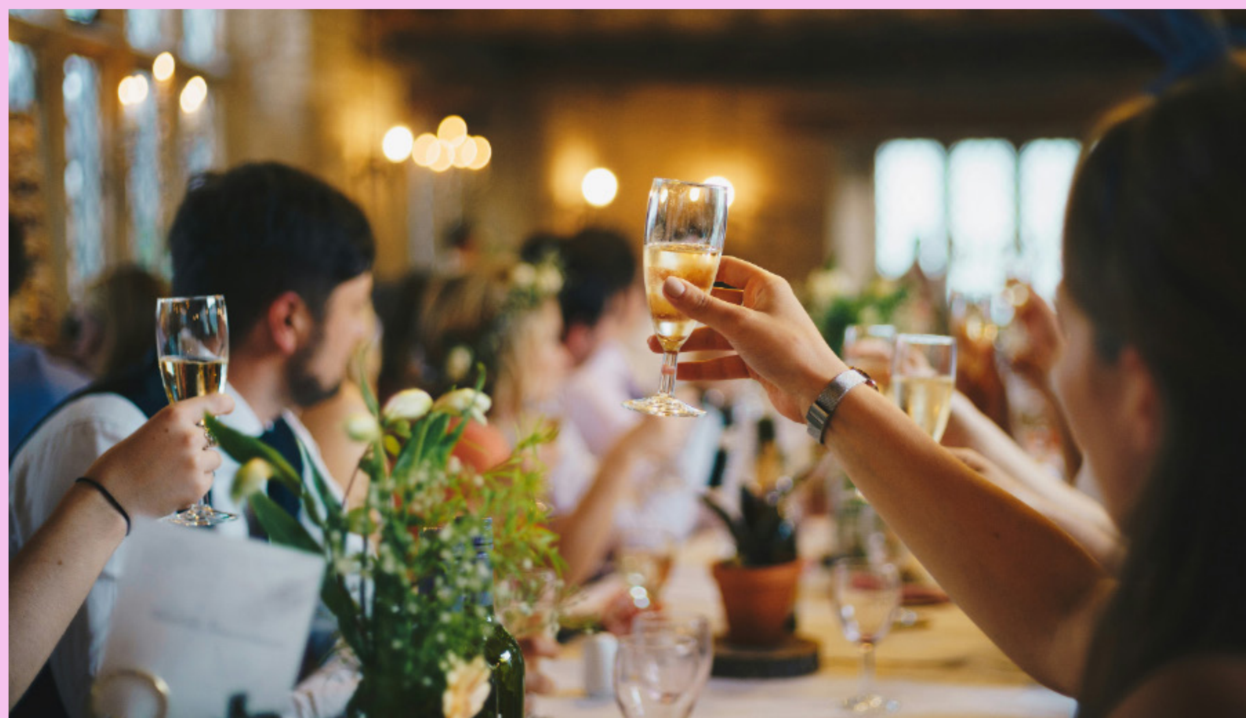
WATERFRONT VENUE FOR EVENTS OF ALL KINDS