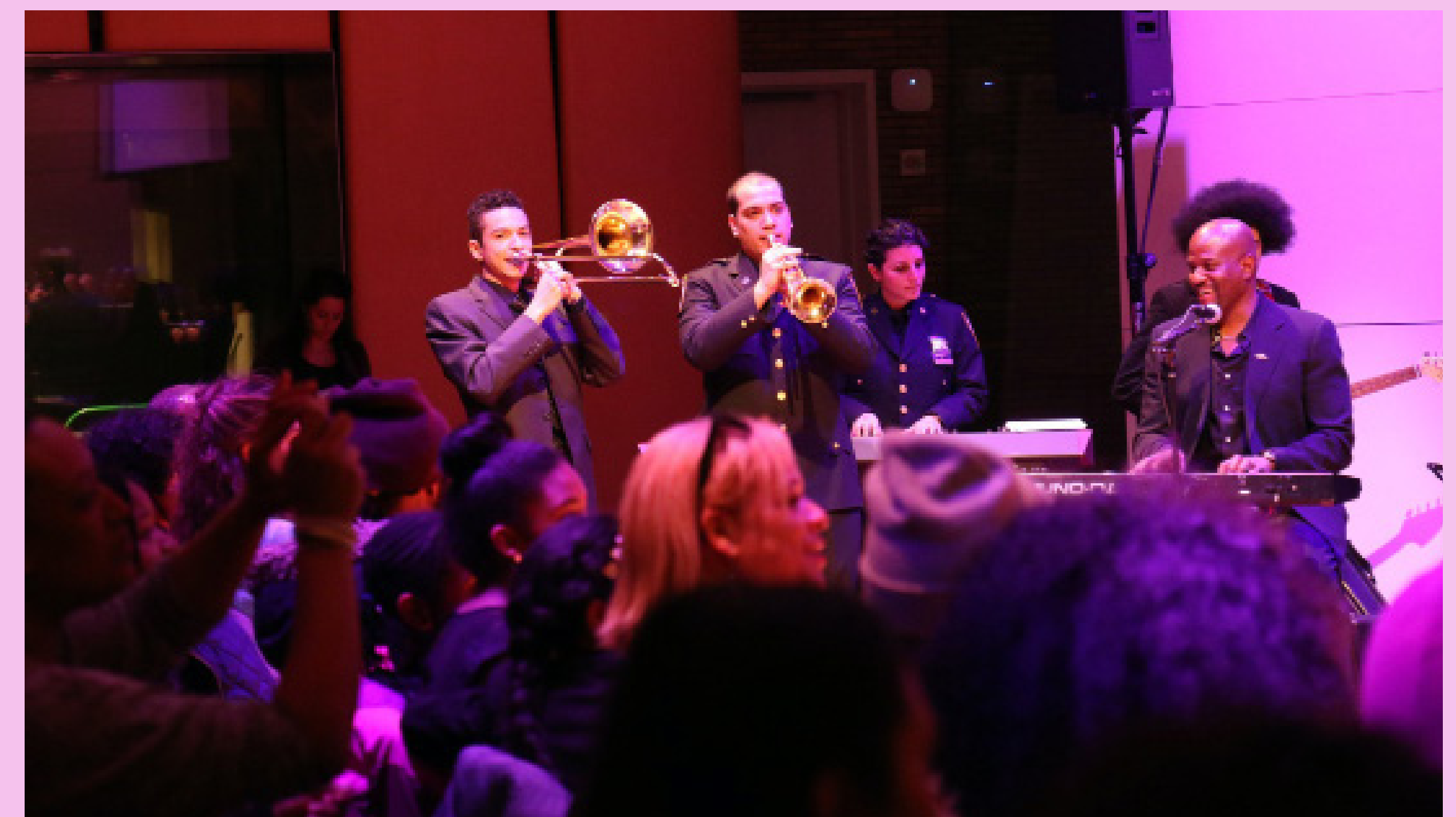
COMMUNITY ENGAGEMENT + LIFELONG LEARNING